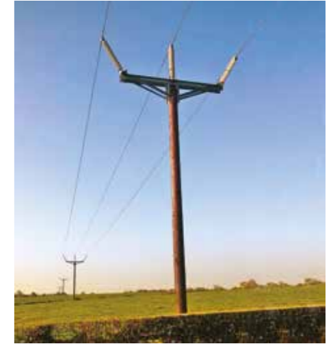
Single wood pole Trident – approx. 12m

landowner requests when determining the best location for poles on site.