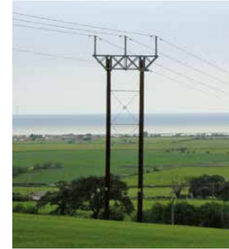
Heavy duty double wood poles – approx. 15m

potential impacts on important sites, communities and properties. A Trident design also assists us in addressing