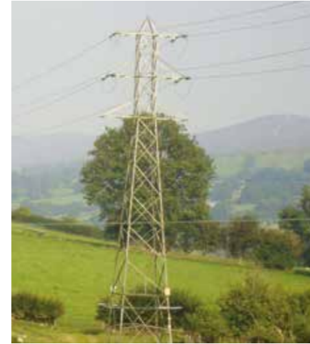
Steel pylons – approx. 26m

This design offers more flexibility in how we route the line than the other options, which helps in reducing